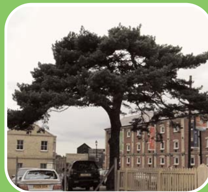
Tree at Mistley

Mistley Station - The fir tree to the right of the entrance to Mistley station was planted circa 6th April 1864 to commemorate the "turning of the first sod" to join the Harwich Branch of the Great Eastern Railway with the Tendring Hundred Railway to Walton on the Naze. The tree, believed to be one of six, has a preservation order on it.