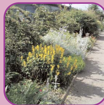
One of many flower beds at Chappel