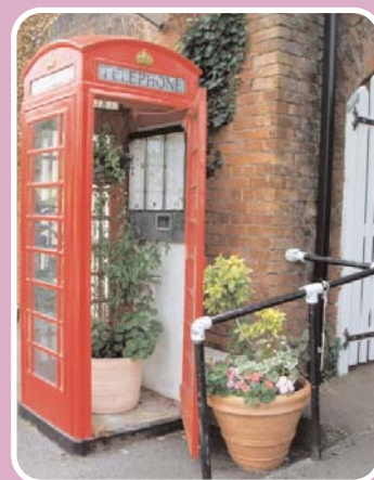
Chappel planted phone box

Corrine also uses water retention granules, the baskets are lined with old compost bags, the tubs have polystyrene in their bases to make them easier to move, this uses up scrap polystyrene and saves on compost. Pots and plants are also saved from year to year. Finally she has plans to save rain water in water butts as long as they can be screened and not look too unsightly. A big thank you to all of the station adopters, volunteers and helpers for their continued enthusiasm, hard work and fund raising.