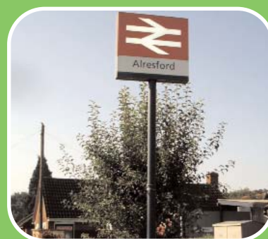
Pauline's apple tree